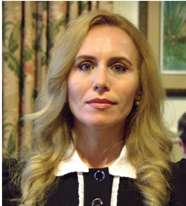
Leadership Class V Graduate